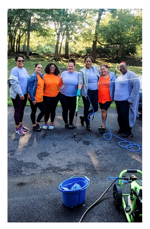
Unified's management staff in Hagerstown held a car wash for our DSPs.

Unified hosted a fun-filled spirit week to celebrate our amazing direct support professionals (DSPs) during Direct Support Professionals Recognition Week, Sept. 8-14.