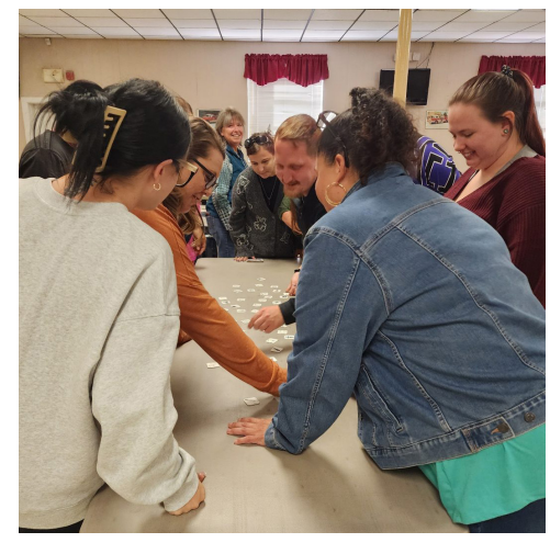
emergency. Often the 🛕 Unified's staff participate in year-round trainings to keep people safe.

in the drills and safety trainings. "For residents living in Unified's apartments, we take a deep dive into potential hazards in their environment and look at how we can ensure these individuals are safe and know how to problem-solve in certain situations."