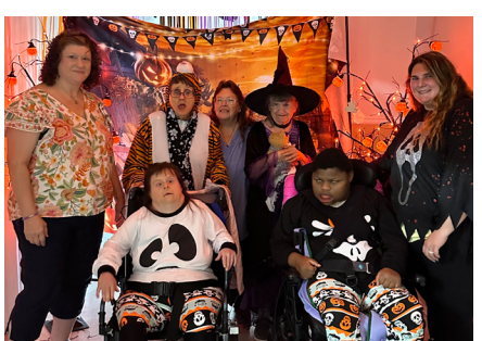
Individuals from Cumberland had a spooky good time celebrating Halloween.