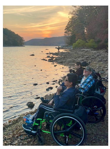
Relaxing at Deep Creek Lake is a favorite pastime of individuals from Frederick.