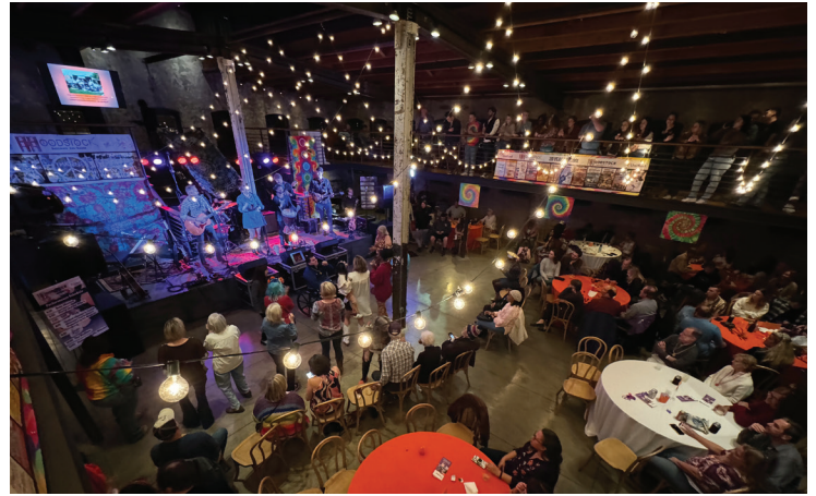
▲ Once again, Roses n Rust was the headliner for Hoodstock XX.