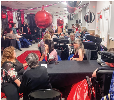
▲ Participants in the Cumberland Day Program shine bright at prom.