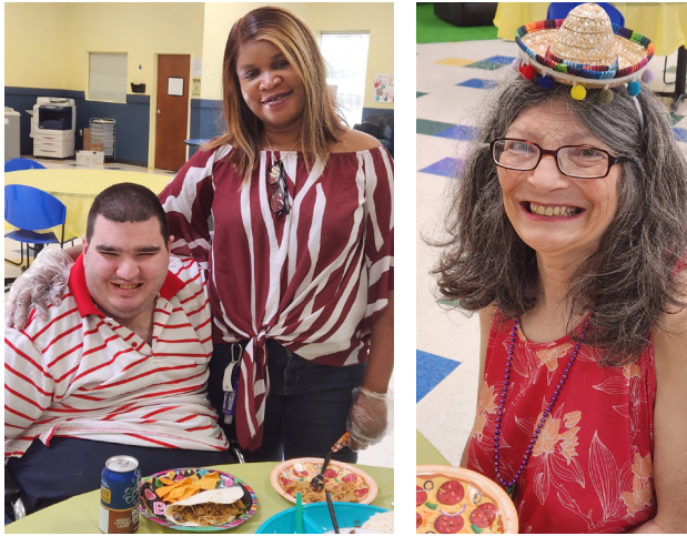
▲ Taco Tuesday brings smiles to individuals who participate in the Crossroads Day Program.