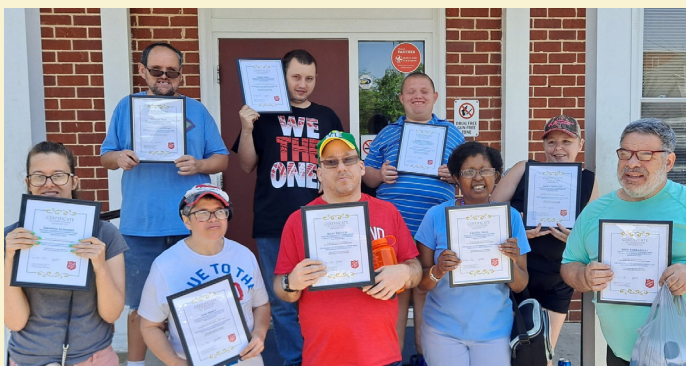
▲ The Salvation Army recognized individuals in Unified's Hagerstown CDS program for their volunteer service at its local food pantry.