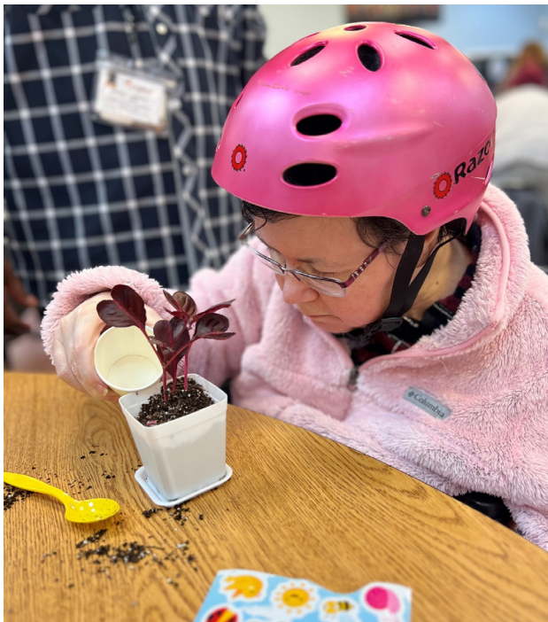
▲ An individual from the Frederick Day Program welcomes spring with a new plant.