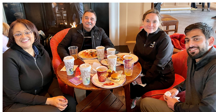
▲ Guests of Presenting Sponsor Sandy Spring Bank enjoy the post-tournament cocktail party.