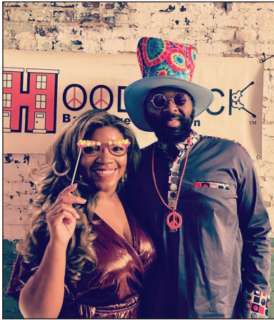
Guests celebrate Hoodstock.