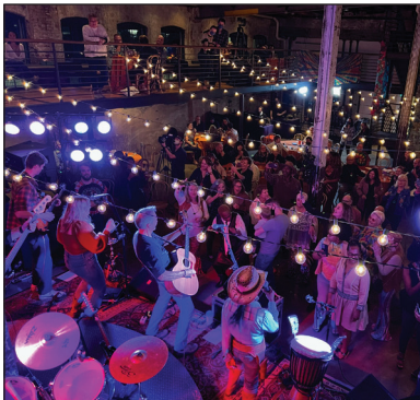
Roses n Rust wow the guests at The Winslow.

Showcasing the rock/folk music scene of the late '60s and early '70s, mixed with some contemporary music, Hoodstock featured music by Roses n Rust, the event headliner, and The Wafflers.